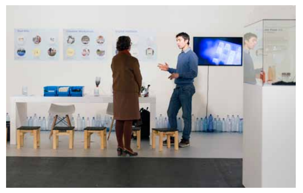
Water hackers workshop by Giacomo Piovan, 2016

Whoever is involved with water is involved with sustainability. Our overconsumption of fresh water is not an issue anymore; it's a threat. In 2030, the availability of fresh water will have become such a major global concern as to truly be considered one of the most important menaces to human development. This concern is not new, and it cannot be said that the world remains completely negligent. Designers and producers of water-related appliances know that they cannot be taken seriously anymore if their products don't address the matter. There are cleverly designed devices and services that are rightly marketed as sustainable design solutions. The problem with this, however, is that the sustainable aspect remains enclosed within the designed object, limiting the empowerment of the end-user to the ac-